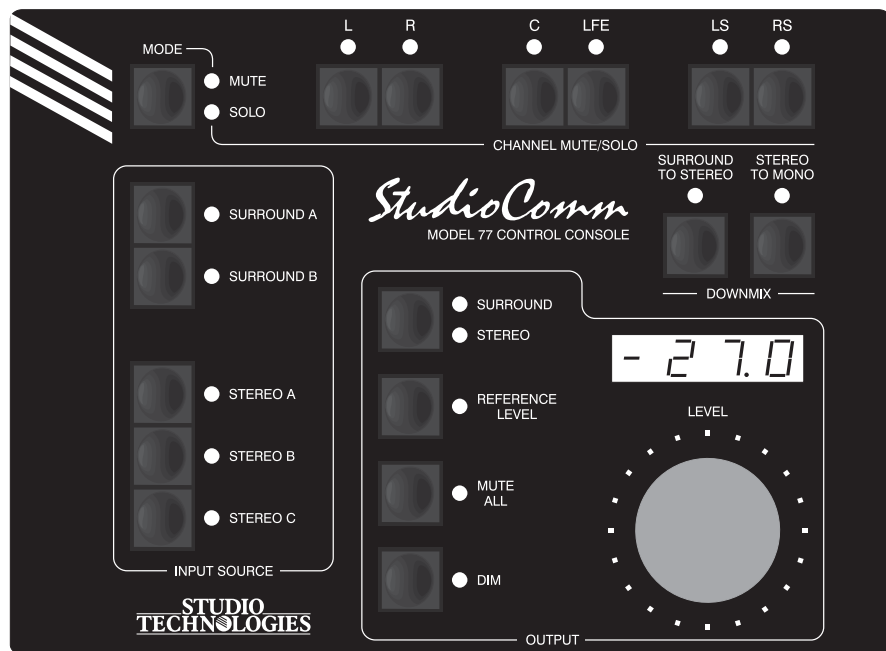
Model 77 Control Console Front Panel